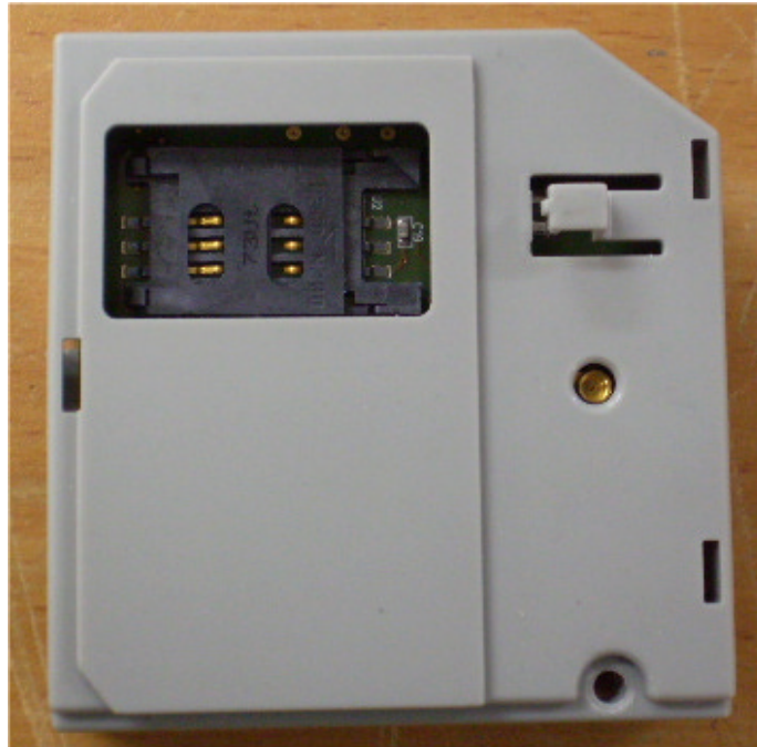
Photograph No.19 GSM module front view